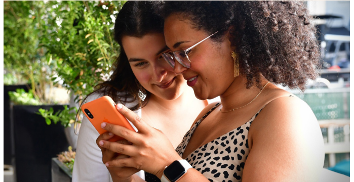
NOTE: Images are from events in 2019, pre-COVID-19.

This is a student-founded and student-led GSEE community group for graduate students of color who are interested in and/or passionate about the outdoors and/or environmental justice and inclusion (follow @uw poc outdoors on Instagram for updates).